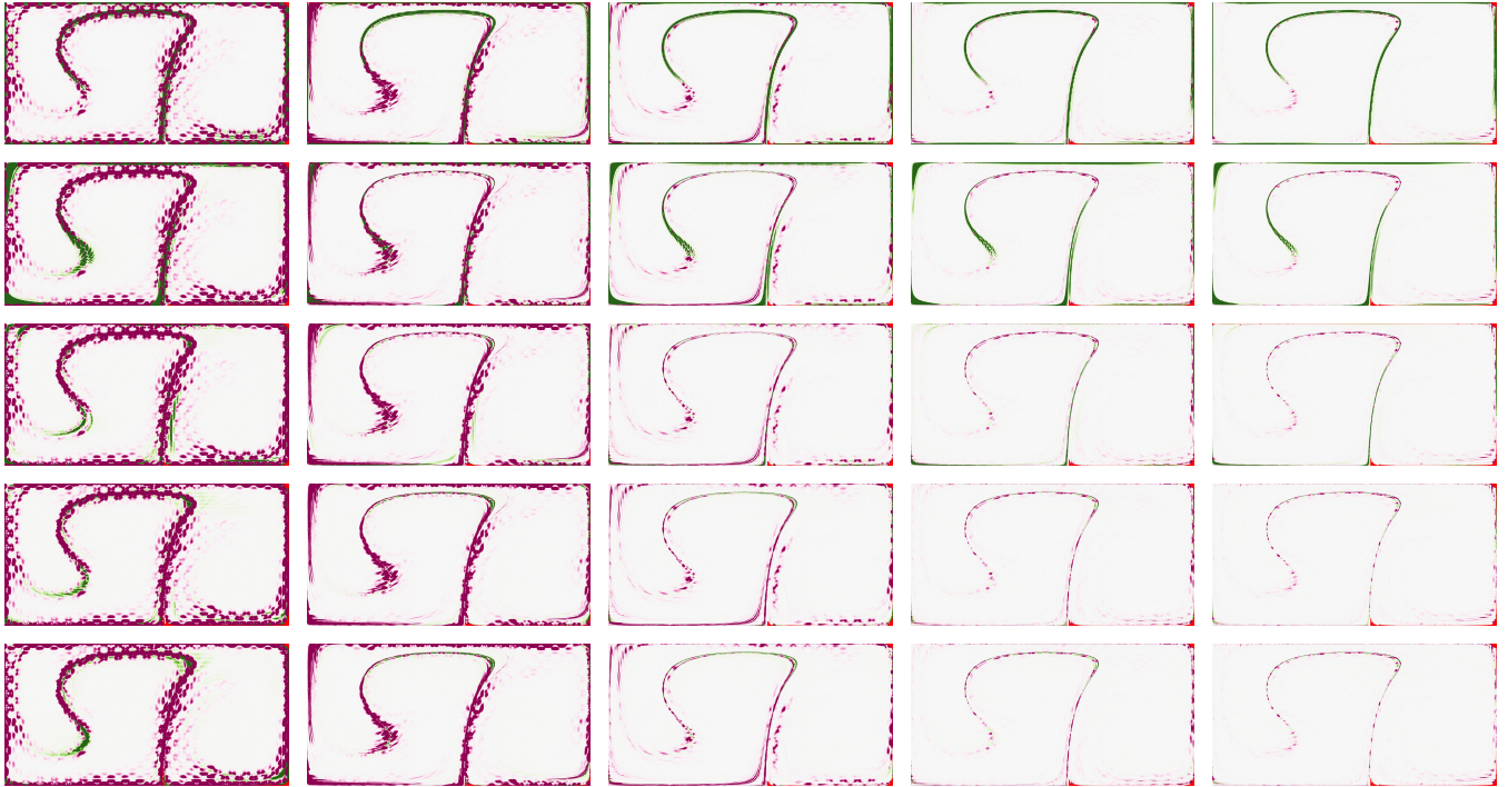
Figure 1: Comparisons c of different temporal resolutions N \in \{1, \dots, 5\} for positive advection time \tau = 10 . N grows from 1 (left) to 5 (right) for our method and grows from 1 (top) to 5 (bottom) for Agranovsky et al. .