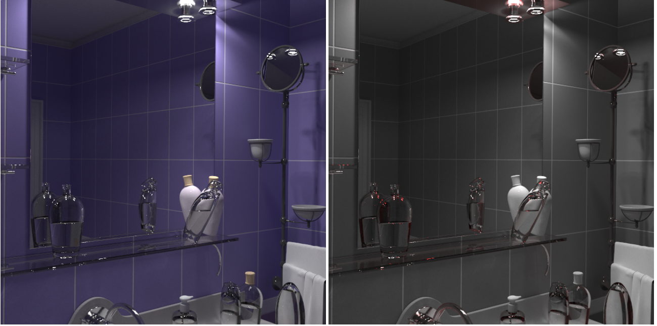
Figure 3: Bathroom scene. Left: intensity of the computed light, right: degree of polarisation overlaid over a grayscale image