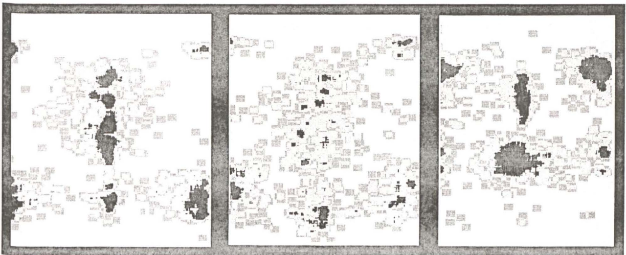
Fig. 3 Visualization of the number of collisions

Also in this case the use of the particle model brings the same advantages as in the previous case. Due to some optimization in the program it is possible to work with several thousand particles (Fig. 2) at the same time (and visualize them). Such a large number of particles gives very extensive information about the situation in the furnace during the course of simulation.