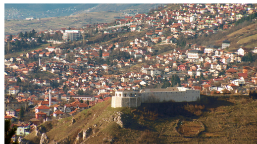
Figure 2: White Bastion - present appearance

White Bastion fortress stands at the outskirts of Sarajevo overlooking the city (Figure 2). The archaeological excavations of the site have found remains from the medieval, Ottoman and Austro-Hungarian period. The findings are registered and conserved for the purpose of the exhibition hosted in Museum of Sarajevo.