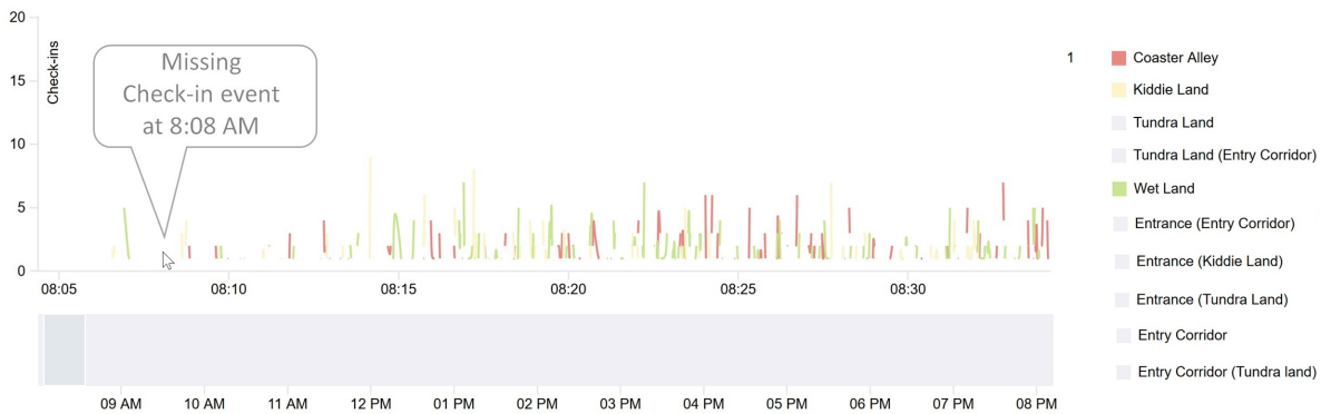
Figure 3: Temporal Determinacy Problem.