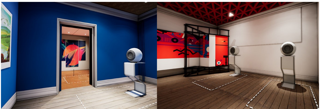
Figure 1: (Left) Image of the two-room (2R) condition. Speaker is on the right of the image and doorway in the centre with view of second room. (Right) Image of one-room (1R) condition. Both speakers are placed within one room