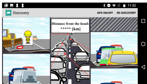
Figure 1: Illustration of expected application screen

An experiment was conducted to confirm that this virtual remote view system propagates images taken by a smartphone ahead properly. Following thresholds and constant are used empirically in