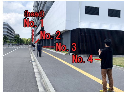
Figure 2: Appearance of experiment