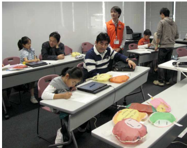
Figure 4: Photo of the workshop.

We held a workshop as a user study to evaluate our system. The subjects were 6 pairs of schoolchildren and their parents. Figure 4 shows the user study. The objects shown in Fig. 5 are the balloons created by the subjects. We used sheets of tracing paper as the material.