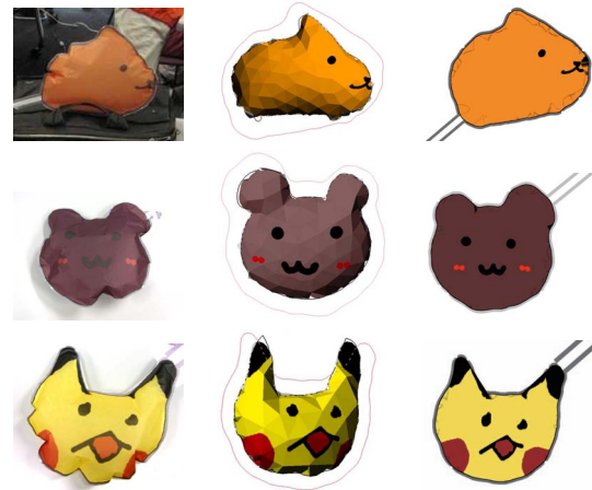
Figure 5: Examples created in the workshop. Left col.: created objects, Center col.: images designed by the subjects, Right col.: patterns generated by our system.

We developed a system for designing the shape of a balloon made with thin and non-stretchy material. By using FEM analysis with TDK elements, the inflated shape can be simulated. We evaluated the usability of our system by organizing a workshop. As future work, a comparison of the results with and without using our system will be conducted. We will also evaluate the computing time. This will help ascertain the most appropriate mesh for the simulation. In addition, we want to develop this system so that it can process more