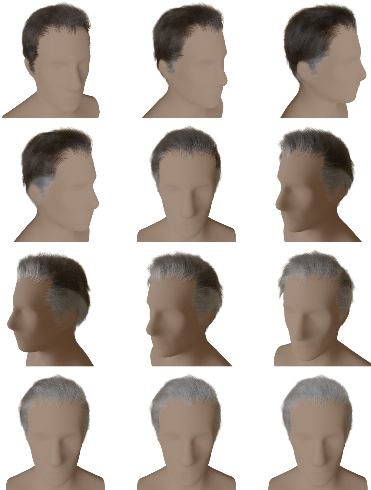
Figure 1: Frames of the hair aging simulation to illustrate the increasing greyness. Increasing age from left to bottom and top to down, from approximately 35 years old until around 70 years old.