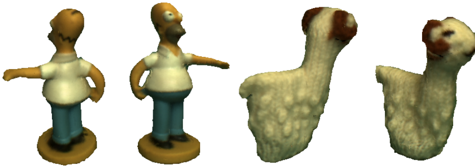
Figure 3: Renderings of captured models of a Homer Simpson figure, and a sheep finger puppet