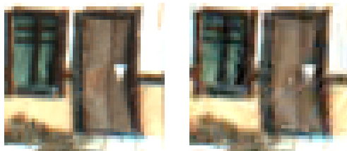
Figure 4: close-up comparison of an object rendered uncompressed (left) vs JPEG compressed at 25% (right). Table shows the size of this model with various settings.

We also apply GZIP compression to all data. This reduces the size of geometric data as well as providing loss-less compression of basis images when the highest possible quality is required.