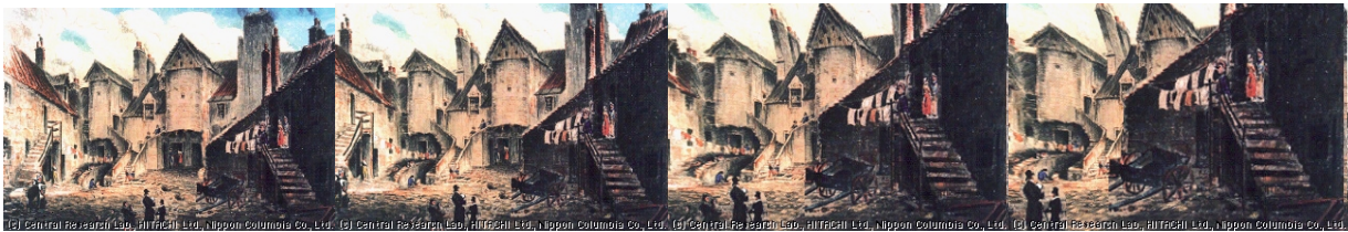
Figure 3: Morph of 2D image to change viewpoint by using a user defined perspective model . Created using Hitachi's "Tour into the Picture (TIP). White Horse Yard 1819, © Edinburgh Central Libraries