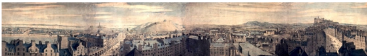
Figure 1: Panorama of Edinburgh from St Giles Cathedral. Robert Barker 1790.