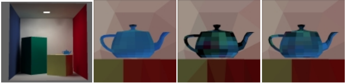
Figure 2: A test scene and details (first and second image) rendered with Monte Carlo Radiosity (third image) and with the Pyramidal Hemisphere Subdivision method (last image)