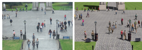
Figure 1: Photograph of the open zone (left) and the virtual reconstruction (right). The orientations of individuals in these reconstructions were modified according to rules for comparison through perception studies.

Modelling pedestrian behaviour has been subject to a great deal of investigation and many noteworthy achievements have been made in synthesising high-level behaviours (see [ST05] [PAB07] for some recent examples). Yet studies focusing on how viewers perceive and evaluate the plausibility of the resulting properties and behaviours remain scant. This issue is of great significance in the domain of graphics, where accuracy of simulation may be traded for performance in order to display larger crowds than would otherwise be possible while minimising perceived errors in the behaviour. In this paper, we focus on the first step in an evaluation methodology that we are developing to allow us to better elucidate this complex issue. This first step is described in Section 3, and considers the construction of experiments to evaluate peoples general impressions of static scenes, capable of accounting for factors such as the density, orientation and positioning of pedestrians: in this paper, we focus primarily on orientation. Rather than considering pedestrian properties in isolation, a central theme in our methodology is to also consider the context in which it appears. There can be many different aspects relating to context, which we classify here as being of two general types: firstly, nearby pedestrians and objects that may affect an individual, and secondly,