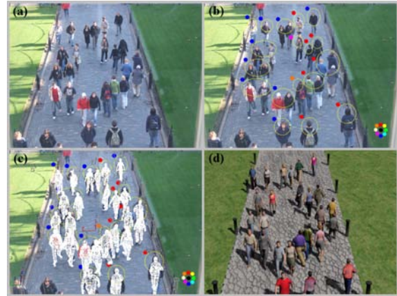
Figure 2: Reconstructing the scene. An (a) initial photograph is (b) annotated with groups and their orientations. Camera parameters are matched up with those of the original camera so (c) characters can be placed corresponding to the transformations of the real people resulting in (d) a virtual scene with a similar composition to the real one.

Each photograph was annotated manually (see Figure 2(b)) in order to highlight groupings and their orientations. Groups are deemed to consist of one or more individuals. Each group is designated by an ellipse, which expands to cover all members of the group. Each ellipse is colour coded according to whether the corresponding group is static ( red ) or mobile ( yellow ). All orientations are classified as belonging to one of the following 8 rotations specifying cardinal directions: 0, 45, 90, 135, 180, 225, 270 and 315. Each direction is associated with a unique colour code, to aid recognition of the general characteristics of the scene.