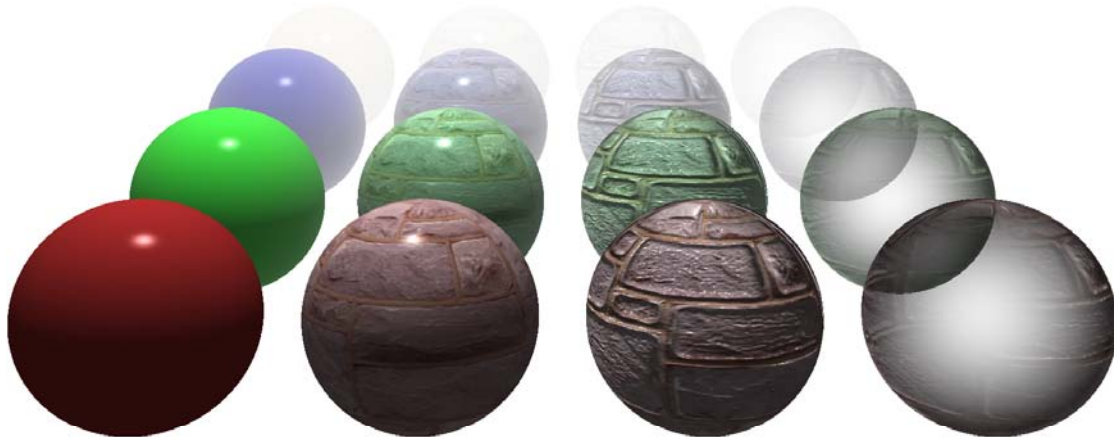
Figure 2: Compositing of different effects rendered by nested shader programs. Phong-shading is combined with texture mapping, normal mapping, and an x-ray shading effect (from left to right).

the global handlers onInit and onFinish apply the language specific state ( gl_Vertex ) to the context and vice versa. They can be placed in the root node of a scene graph. The onTransform handler applies the viewing and projection transformation to the input vertex and will only be invoked if no other transformation handler is active: