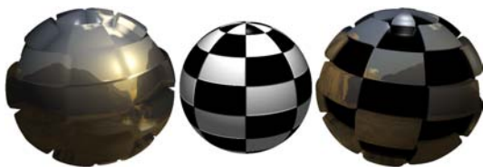
Figure 1: Example for the automated combination of displacement and normal mapping shaders.

Categories and Subject Descriptors (according to ACM CCS): I.3.1 [Computer Graphics]: Graphics processors; I.3.6 [Computer Graphics]: Languages; I.3.8 [Computer Graphics]: Applications; D.1.2 [Programming Techniques]: Automatic Programming