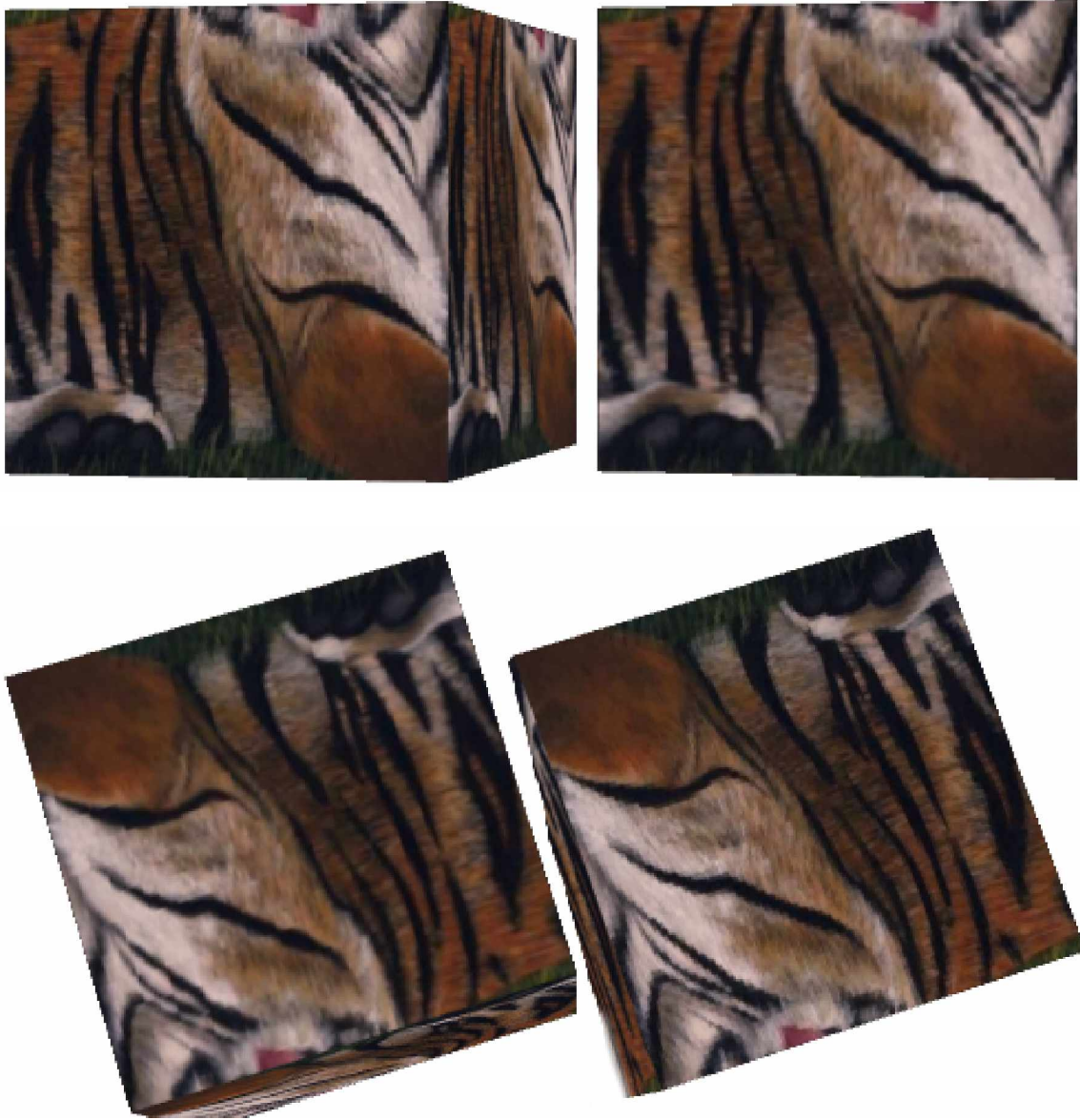
Fig. 9(a): Test level 192: (Top) LHS is 192 and RHS is 90% resolution interpolated. (Bottom) LHS is 75% interpolated and RHS is 192. It can be seen that the quality degradation on the bottom left cube is obvious.