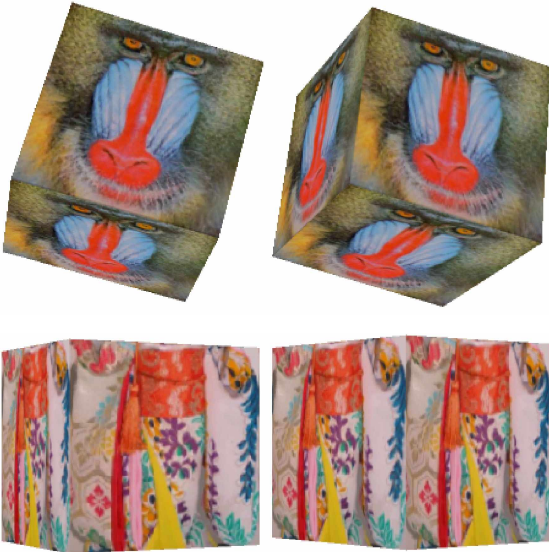
Fig. 9(b): Test level 160: LHS is 160 and RHS is 75% resolution interpolated. It can be seen that the baboon and kimono texture quality on both cubes are similar.