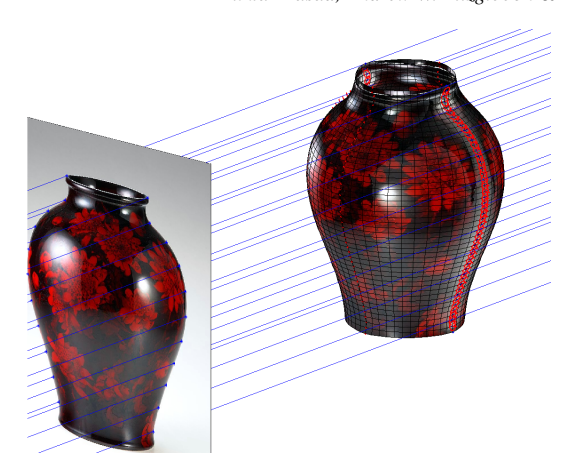
Figure 1: We "lift" 3D models from images with a simple user interface. For simple models, the object silhouette provides all necessary constraints, while a number of simple editing operations allow more complex models to be created.

in the general 3D case, although the 2\frac{1}{2}D solution has been known since [Sze90].