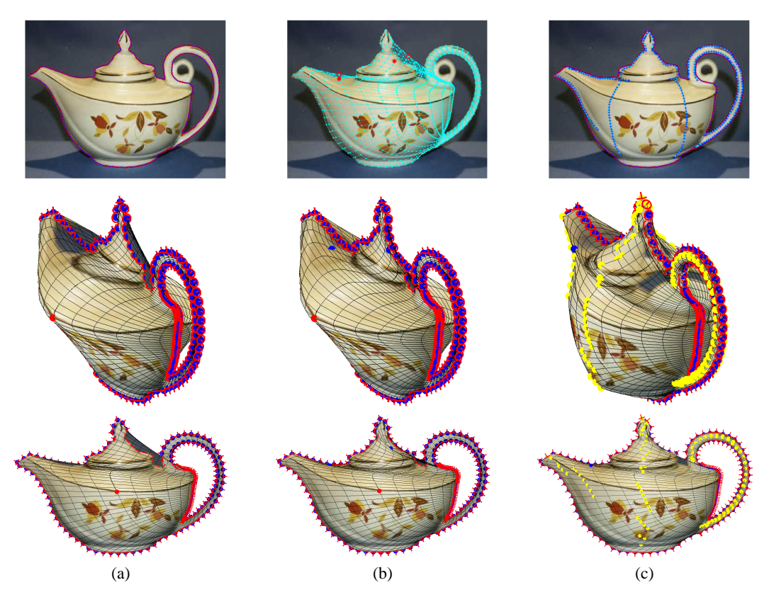
Figure 3: Steps in model building for a genus one surface. (a) User supplies silhouettes and marks points of high curvature. Some of the model spills into the background. (b) User drags model points into the interior of the object. The minimization corrects the spill while maintaining silhouette consistency. (c) The user adds inflation curves to improve the 3D shape, creating a narrower spout, and adding a bulge at the base. Overall user input is the silhouette (power-assisted), three spillage drags, and six inflation curves, none of which need to be precise. Middle and Bottom row: 3D models with the (u, v) curves and constraints.

thin-plate energy to be found as the solution to a linear system. Previous energy-based approaches have relied on iterative optimization strategies which frequently fell into local minima or mangled the surface mesh; and previous ad-hoc approaches could not guarantee to maintain the silhouette without complex polygon book-keeping.