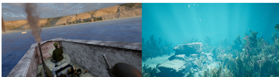
Figure 1: Screenshots from the “Exercise Smash” virtual heritage experience. Left: landing a Valentine DD amphibious tank on the beach in Studland Bay in the south of England; Right: virtually diving to the wreck of one of the seven Valentine DD tanks that sank in April 1944.

1 The National Centre for Computer Animation, Bournemouth University, UK