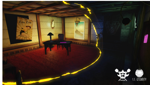
Figure 1: SS Eternity: An orb is used as a timeportal to cross different time zones and solve puzzles on a ship.

Bloom was developed based on the themes of chaos and pacifism (see Figure 2). Players would solve plant based puzzles