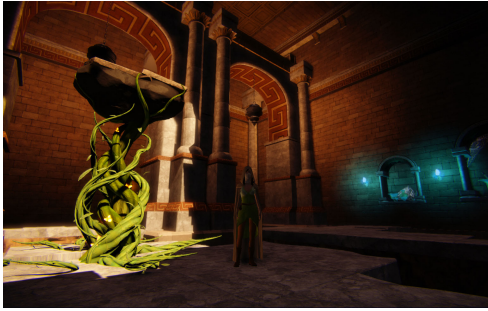
Figure 3: A platform plant in the game Bloom

phong nodes and assigned to a function. This simplified its use for artists, as they would simply plug in Diffuse, Normal, AO, Roughness and Specular maps [LH13]. Existing nodes from UDK were used for the shader creation, which meant there was no extra need for optimisation.