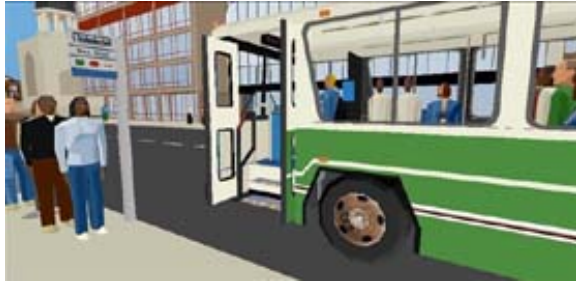
Figure 2: One virtual environment used in the software developed by the VIRART Group.

cess in the development of the hearing and language of children [OEP03] (see Figure 1); PEAPO, a web site with an easy to use resource that tries to promote the communication and autonomy capabilities in people with Autism Spectrum Disorders (ASD) [PER00]; EDU356, a web site with multimedia activities oriented to promoting and reinforcing the educative contents for children of different ages [DEC02]; Hola Amigo, an educational graphic interface for learning non-verbal communication using the language of SPC (or Pictographic Symbols System for non-verbal communication) [ASP99].