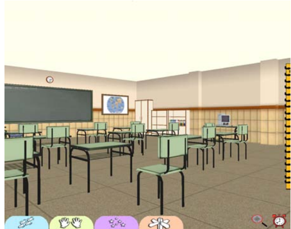
Figure 7: General view of the classroom in the Virtual School application.

Navigation, object selection, and user-application interaction model in general, are all similar to those used in the supermarket. Subjective point-of-view is kept, too, but in this case the user has no visual representation inside the environment.