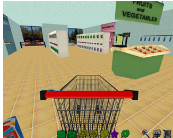
Figure 3: General view of the Virtual Supermarket application.

At the University of Valencia we have developed a Virtual Supermarket for teaching environmental understanding