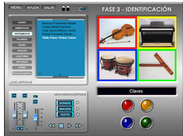
Figure 1: Snapshot of the interface used in the SEDEA program.

Another condition often associated with learning difficulties are Autism Spectrum Disorders (hereafter referenced as 'autism'), as three out of every four individuals with autism show mild-severe learning difficulties (MR). The American