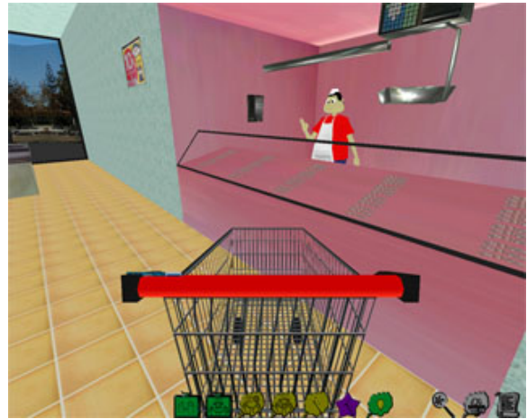
Figure 6: Butcher's employee greeting the user, in the Virtual Supermarket.

with them, if the teacher tries to promote the same imaginary play but outside the computer and between him/her and the child.