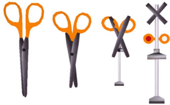
Figure 10: Four steps of imaginary transformation of scissors into a train sign, in the Virtual School.

Adaptability is a very important feature of this application, referring to the range of disorders it can be used to