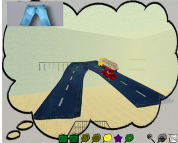
Figure 5: Imaginary sequence in the Virtual Supermarket.

For selecting objects or interactive elements in the virtual setting, is possible to use the mouse or a tactile screen. Both interfaces are possible, depending on their availability in the school or centre where the software is used, but the tactile screen is easier to use for making selections inside the virtual world, because the individual only has to use his/her finger to touch the element to be selected.