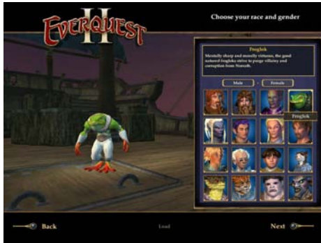
Figure 1: Role play as a Ever Quest 2 froglok character.