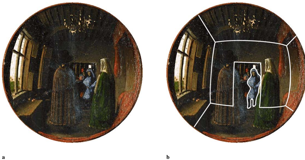
Figure 2. (a) The image in the convex mirror in The Arnolfini Portrait, as originally painted by Van Eyck. (b) The mirror image corrected for spherical distortion (created by Criminisi et al. [5]) with room edges and the silhouette of the individual in the door opening superimposed, so measurements could be taken.

We deemed the constellation of the mirror image – even though it's a small detail – more reliable a source in determining the room's height than either the bench or the window with regard to the (much less clearly defined) back wall visible in the main part of the painting. Moreover, breadth is, at all, unrecoverable by any other means than the mirror image.