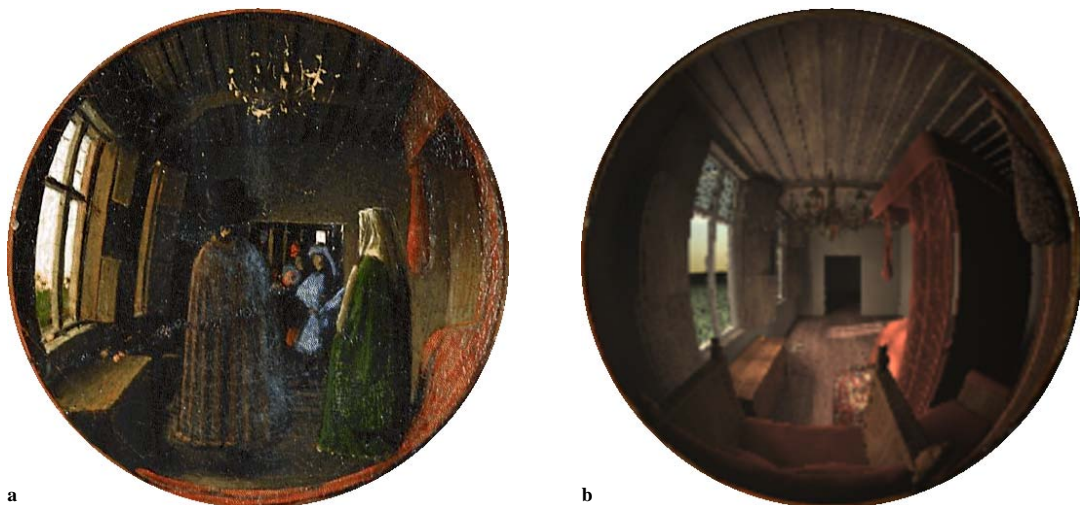
Figure 4. (a) The original convex mirror in The Arnolfini Portrait. (b) The convex mirror in the three-dimensional reconstruction.

Both issues remain unresolved in this paper – and need further investigation – but as of yet we have thought of two possible explanations. One, invalidating some of the conclusions in [5] with regard to the actual scene , is a larger sphere from which the mirror was cut, or a mirror shape other than spherical.