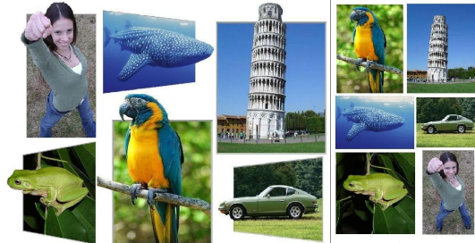
Figure 2: Left:our results; right:input images.

effects, we take some post-processing such as adding borders as is shown in Figure 3. Besides, we also make pseudo-perspective transformation by stretching the border of the non-highlighted region, as the example of fish, frog and car in Figure 2.