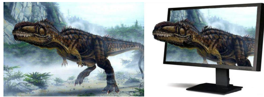
Figure 3: Left:input image; right:our result by adding border.

We also compare our results with "Virtual Passepartouts" method proposed by Ritschel [RTMS12] since we focus on the similar research content, the comparison is shown in Figure 4. Compared with "Virtual Passepartouts" method, we don't need the depth information of the image and consider visual saliency instead, since it is easier to get visual saliency for a single 2D image our method is suitable for a wider scope of applications relatively. Besides, instead of exposing certain numbers of pixels of foreground region, we expose certain proportion of the foreground region and take into account high-level composition rules as guidelines for automatic cropping which is in conformity with the principle of pseudo-3D painting and get more harmonious results.