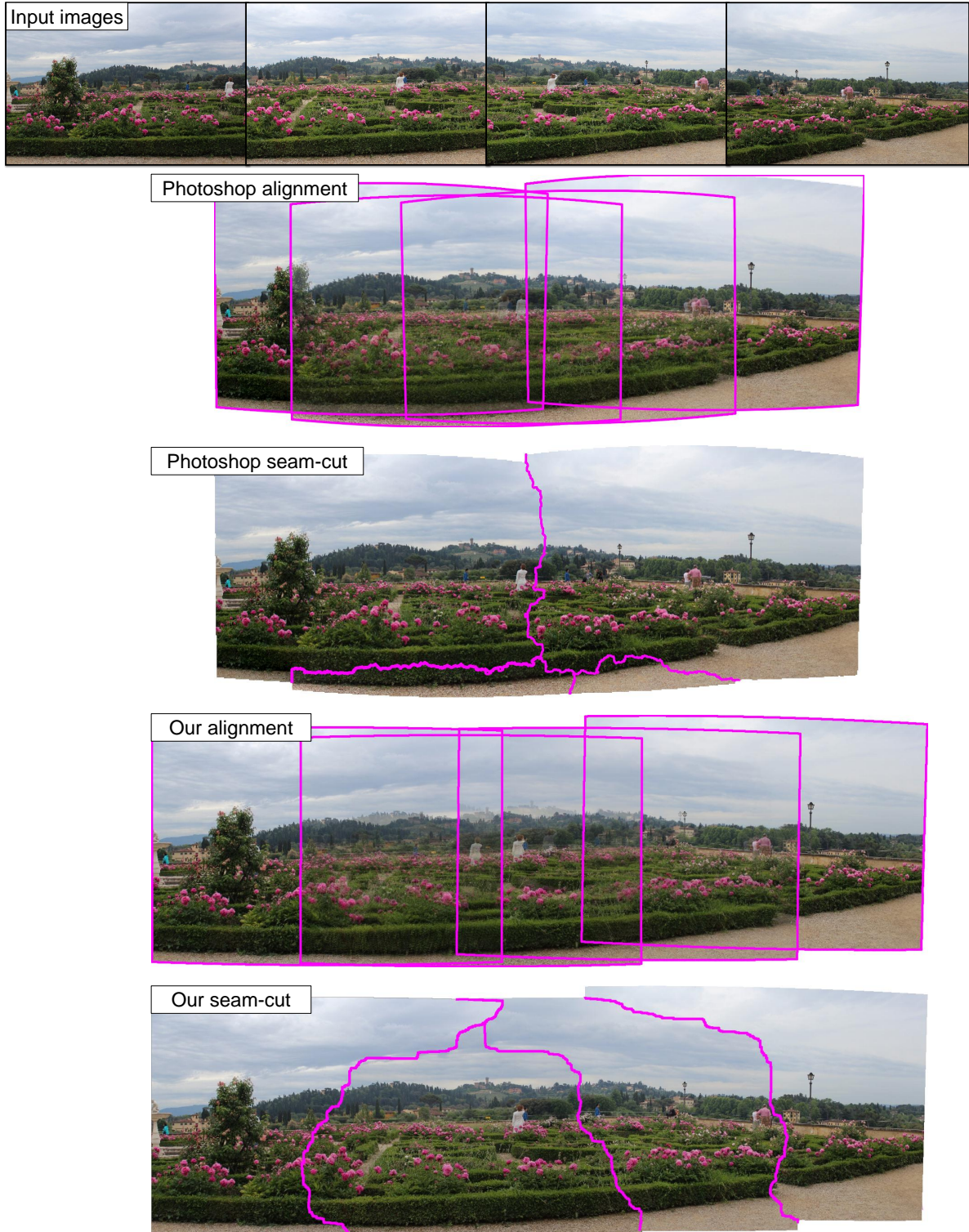
Figure 1: Intermediate results for the first panorama in Figure 4 of the submitted paper.