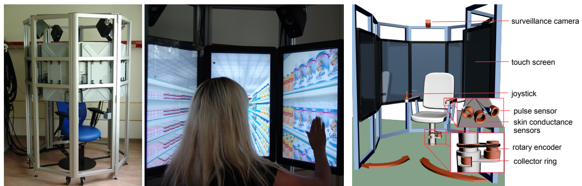
Figure 1: Two photographs and a simplified illustration of our OCTAVIS virtual reality (VR) system. Eight screens, arranged in an octagon, provide a 360° panorama visualization of the virtual environment. Two door segments can be opened. Navigation in the VR is performed through a modified office chair. Its orientation determines the movement direction. A “throttle joystick” in the armrest controls the movement speed. Easy and natural interaction with objects is enabled through a simple touch screen interface. Biosensors and surveillance cameras permit permanent patient observation by clinical staff.

4 Neurobiology & Genetics of Behavior, Witten Herdecke University