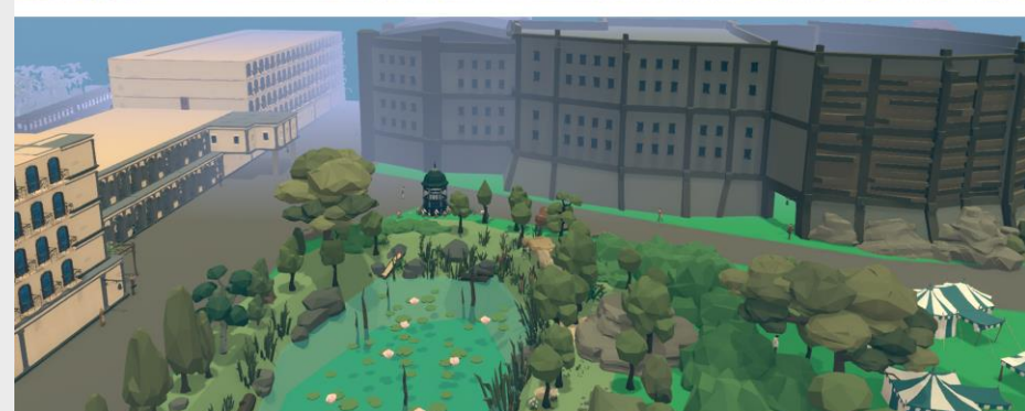
Figure 1: The top image is of the Lincoln Delph Pond and Isaac Newton building. The bottom image is taken from TULI, the virtual counterpart.