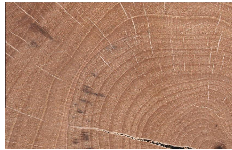
Figure 2: Beech Cross Section (used by permission [Sic])

The shape of the branch in cross-section expresses the quality of the cluster in terms of the K-means clustering by defining the minor axis of the cross-section ellipse as a percentage of the major. A cluster is compact if the average distance of all the component items from the cluster centroid is small, so higher quality clusters have a shorter minor axis and are more oblate or "squashed" in appearance.