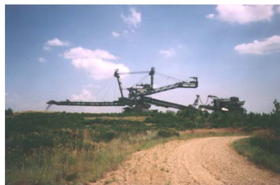
Figure 3: Open-cast mining