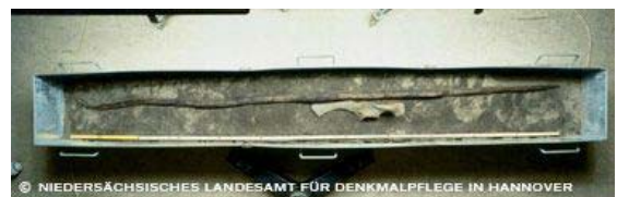
Figure 2: Prehistoric spear