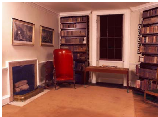
Figure 1. The Monticello library. We created this 3D model, for use in the Virtual Monticello exhibit, with a laser scanner and digital camera.

the site in 2000. To this end, the Monticello curators referred the NOMA curators to us. We forged a collaboration that provided us with an opportunity to demonstrate some of our research results to the public. NOMA also profited from the partnership, receiving two exhibits that offer 3D views into Jefferson's home. The first, which the museum titled Virtual Monticello (Figure 1), is a life-sized rear projected virtual environment. The