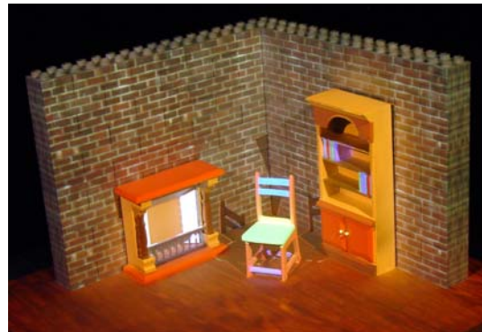
Figure 2. Shader Lamps. We built a computer model of this dollhouse to prototype construction of a Shader Lamps exhibit of Jefferson's library. We painted the dollhouse furniture and walls with white paint (top) and illuminated the model with two carefully calibrated projectors (bottom). Precise calibration and modeling is difficult to achieve so some green light intended for the chair appears on the floor.

Shader Lamps. Raskar et al. introduced the concept of shader lamps , whereby projectors are used to illuminate physical objects [1]. We considered building a 3D computer model of Jefferson's library and constructing a physical scaled model using a stereo lithography printer. Then we could have lit the white physical model with projectors, for example simulating sunlight varying from dawn to dusk or a candle passing through the room at night. Clearly, this would have been a unique exhibit and a good way to expose the public to our research work. We made a prototype by constructing a model of a dollhouse and lighting it, as shown in Figure 2. However, the Shader Lamp construction process is very labor intensive because it requires precise modeling and calibration to achieve the intended effect. Even in the simple case of the dollhouse, light from the chair texture bled onto the floor. We decided that for the museum setting we would have to design an automatic calibration procedure, perhaps with cameras as sensors. Further-