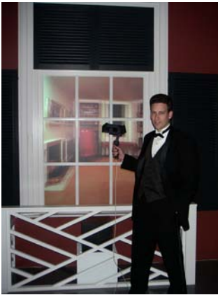
Figure 4. This image shows one window of the Monticello facade where the Virtual Monticello exhibit was installed.

We created a 3D model of Jefferson's library with the 3rdTech DeltaSphere 3000 laser scanner, a commercial version of a scanner that our research group previously invented [8]. This scanner captures very accurate and dense range samples, which we merged into a unified mesh using the iterated closest point algorithm. We texture mapped the model with color images taken from the DeltaSphere's center of projection [7]. Then, we simplified the mesh to facilitate interactive rendering. Finally, we enlisted the help of a local artist to clean up the model by filling holes and fixing certain texture maps. Figure 1 is an example rendering of the completed library model.