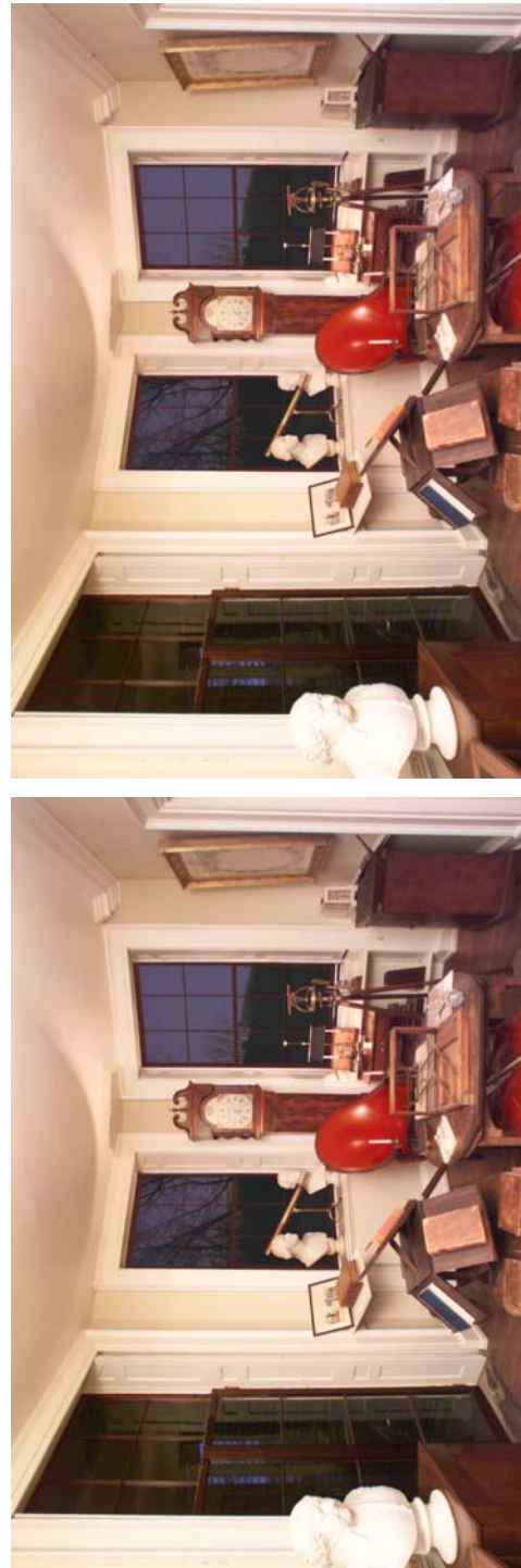
Figure 8. Jefferson's cabinet exhibit stereo pair. View this pair of images "cross eyed".