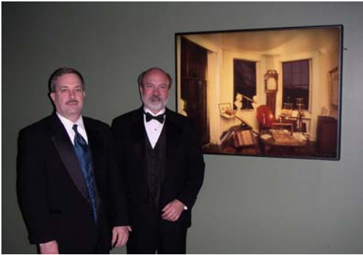
Figure 6. The Jefferson's Cabinet stereogram was built in collaboration with (art) n . As users approach this 1m by 0.75m exhibit, the barrier layer causes the eyes to see two different images, creating the stereo effect.

museum environment. We also provided instructions to NOMA for cleaning the glasses with mild soapy water.