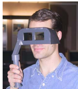
Figure 5. The stereo glasses were custom designed for this exhibit and constructed from PVC material. The bridge piece keeps the device away from the eyes to thwart eye infections and a rubber skirt keeps out stray light.

We opted for a handheld "opera glasses" design inspired in part by a 19 th century stereopticon; additionally, we built six special pairs of glasses that house tracker sensors. The handheld design and bridge piece, which extends to touch the forehead, helps to keep the lenses away from the eyes and thus reduces the likelihood of spreading conjunctivitis. A rubber skirt is used to keep stray light out. The heavy PVC material makes the glasses resistant to the abuse that is inevitable in a