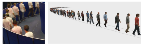
Figure 3: A result from Li's method. Left: A snapshot of motion capture session, where pedestrians followed each other. Right: Periodicity is found in motion capture's data and then transformed into connectable patches.

In the second method, described in [LCS*12], instead of generating trajectories, we use existing data (motion capture or simulation data as shown in Figure 3). We search for portions of data which satisfy two rules. Firstly data have to be as periodic as possible. Secondly the spatiotemporal conditions in the data limit have to match with other patches