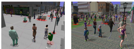
Figure 2: Results from Yersin's method

In this section we describe two different approach to create crowd patches.