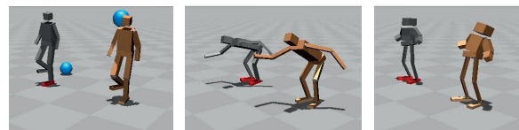
Figure 1: Example results of the control framework.

In an attempt to understand this reservation, we distinguish between two different approaches used in physics-based character animation research. On one hand, there are methods that compute joint torques based on kinematic parameters , such as joint angles or center-of-mass. These methods are relatively easy to implement and integrate well with common physics engines, such as the Open Dynamics Engine or PhysX . Recent publications that use this approach have displayed a variety of robust and versatile locomotion controllers (e.g. [CBvdP10, WFH10]). However, these methods allow style control only through key-framing or optimization for high-level criteria. Methods that use captured reference motions have several limitations or require extensive preprocessing (e.g. [SKL07, YLvdP07]).