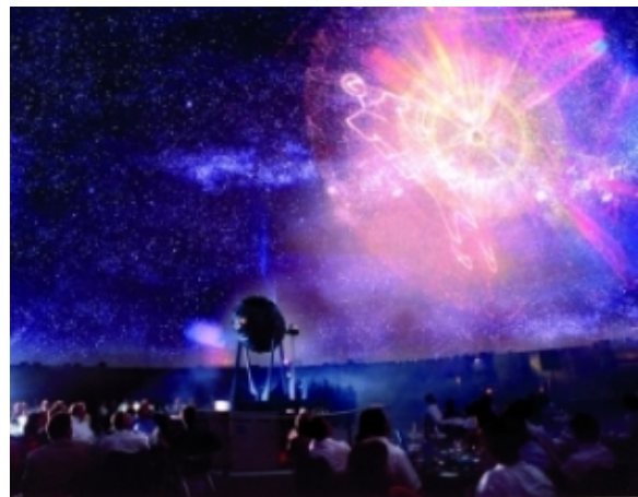
Figure 4: ADLIP system in the Jena Planetarium

A collaborative project between Carl Zeiss Jena GmbH and Jenoptik LDT GmbH, the All Dome Laser Image Projection system (ADLIP) with a surface area of more than 800 square meters was completed in 2006 for the planetarium in Jena. This was the second laser planetarium constructed after the one in Beijing in 2003 and has the same resolution of XGA (1024x768 pixel) and 6 channels too. Figure 4 shows the ADLIP in operation.