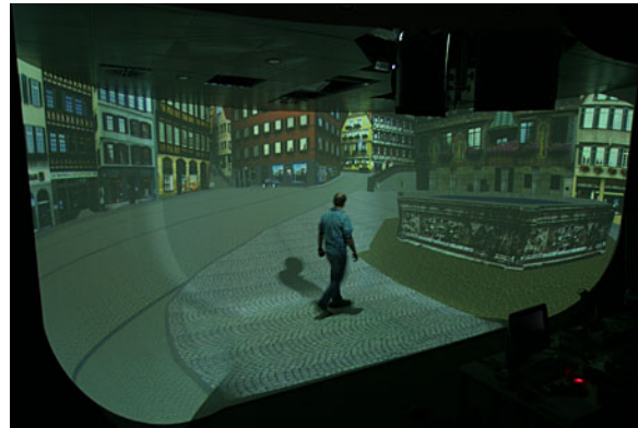
Figure 3: Setup of the PanoLab

The PanoLab [MPI] is a wide-area cylindrical/spherical frontal projection system measuring 7 meters in diameter and 3.2 meters in height. With a resolution of approximately 3500x1800 pixels and a field of view of 230x125 degrees, it is based on a concept quite similar to the one presented here. Figure 3 shows the setup of the PanoLab.