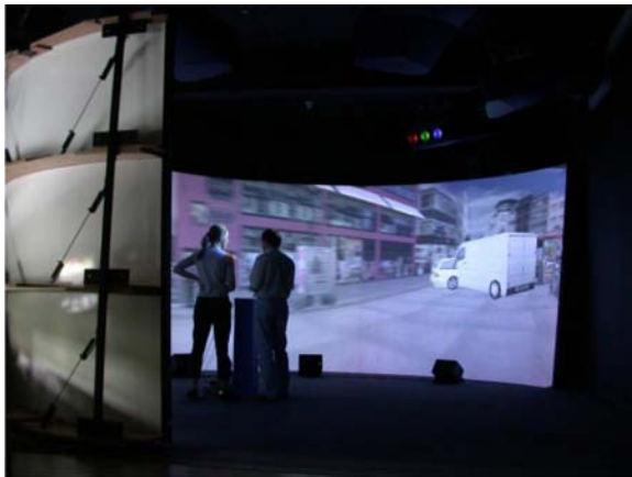
Figure 2: Setup of the i-Cone™

The i-Cone™(see [SG02]) is a 4 channel 240 degree display system with a resolution of 8000x1460 pixels. The screen is 2.80 m high and has a diameter of 6.60 m on the top (see Figure 2).