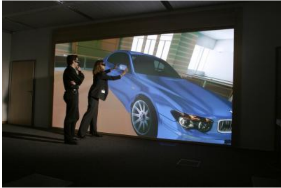
Figure 1: Design review using the HEyeWall®(©IGD-Darmstadt)

One project comparable to the Elbe Dom in terms of size and resolution is the HEyeWall [KS04], [KRR03] implemented by the Fraunhofer Institute for Computer Graphics IGD in Darmstadt. The HEyeWall has a resolution of 18 megapixels, a height of 2.5 meters and a width of 5 meters. 48 projectors and 48 PCs generate a seamlessly blended backprojected image. Figure 1 shows an example.