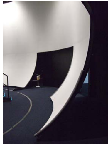
Figure 6: Aluminum screen wall Elbe Dom with entry

It is a cylindrical perforated wall, 16 meters in diameter and 6.5 meters high. The entire screen is aluminum and spans a surface area of approximately 330 m 2 . The screen is not a perfect cylinder however. The diameter of the lower portion of the screen is slightly constricted to create the illusion of ground projection since users look at the screen from a circular platform in the center of the setup (cf. Figure 5 and Figure 6). Since the laser beams are hazardous to eyes