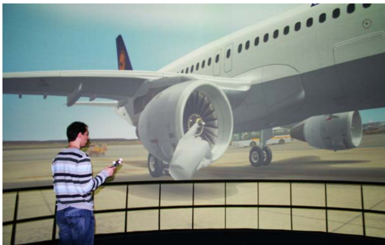
Figure 8: Virtual interactive scenarios in the Elbe Dom: Urban visualization of Lutherstadt Eisleben (top and middle) and pilot flight training sequence (bottom)