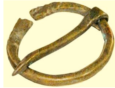
Figure 3: Bronze Pin Brooch

The aim of this part of the project was to create and present 3D models of the existing Roman archaeological and museum artefacts for use within the 3D building reconstruction discussed in section 2 as well as the proposed online and mobile applications. This requires files compact enough for quick loading. Photogrammetry is a technique to create 3D models using a set of photographs. [Rem11] Even though this method does have limitations, particularly for artefacts with complex holes, it was chosen. The attraction of this photographic method is two-fold: cost and file size. The large file sizes produced by laser-scanning and its cost (especially that which also records colour for a model's texture and automates the process) are prohibitive. The software 3Dsom Pro was selected [3Ds12] and 15 artefacts were chosen for scanning nine of which produced successful models. Figure 4 shows one of these ; a bronze Pin brooch.