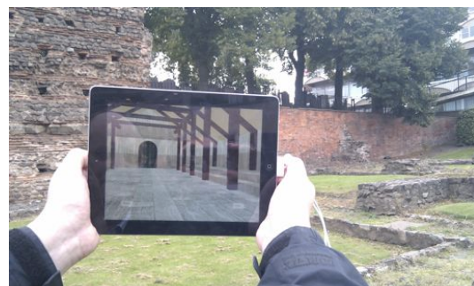
Figure 5: Augmented Reality Phone App.

Research is also currently taking place into the design and development of a Virtual Roman Leicester mobile application which utilises the 3D buildings and artefacts that have been created in earlier stages of the project. Initially, it is being programmed for iPhone and iPad to allow the visual recreation of key Roman sites and artefacts in their correct location. This will utilise augmented reality technology [Azu97] such that virtual 3D models will be visually superimposed on the view of the sites as seen in real-time through the mobile device camera. Figure 5 shows the prototype in action. The iPad display shows the interior of the Roman Jewry Wall Baths actually on the site of Baths in Leicester. This is right next to the Jewry Wall Museum.