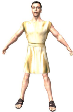
Figure 3: Primus the Tile maker

Along with the character creation it is important to mention that even though there are some digital reconstructions which are populated the goal for this part of the project is to produce a standard character development framework that could easily be adapted to any other Digital Heritage reconstruction and therefore provide the necessary tools to begin populating the environment. In this research, the importance of the characters does not rely on the high quality of modeling texturing or rendering but on the actual process of developing a historically accurate virtual character that can be deployed in a massively multiplayer online game environment with a more complex level of Agent behavior possibly capable of learning from the everyday user interaction.