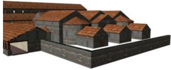
Figure 2: Top- Photograph of existing Jewry Wall Bottom – Texture mapped onto the Jewry Baths Exterior

In terms of overcoming the technical problems, the buildings were remodeled using software that would seamlessly integrate with the game development tool (Unity 3D). Autodesk MAYA proved to be the most reliable piece of software due to the plug ins available and file integration; particularly its FBX export and import format which allowed texture embedding along with the 3D Model. The goal is to reconstruct the buildings and deliver simple, cleaner models with lower polygon count, that can not only integrate with Unity 3D but can also be used in mobile application development (see section 5) as well as the creation of high resolution rendered stills and animations using MAYA's mental ray rendering engine.