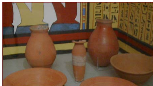
Figure 3: Crockery, some of it duplicated in the virtual temple as shown in Figure 2

Carnegie Museum of Natural History has acquired Egyptian artifacts since its founding and now holds about twenty-five-hundred ancient Egyptian artifacts. The most significant of these objects, over six hundred of them, are displayed in The Walton Hall of Ancient Egypt. In the hall the artifacts are displayed in relation to the daily life and traditions of the people who made them, so that the objects are seen in the context of the culture. To present a cohesive picture of ancient Egyptian society, its technology, its social system, and its beliefs, we arranged the objects by theme.