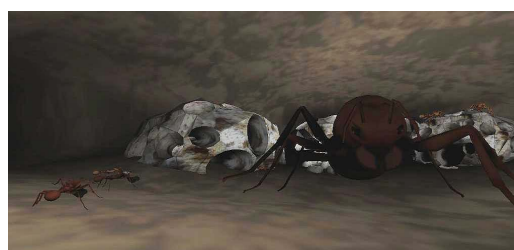
Figure 5: Inside the leaf-cutter ant mound.