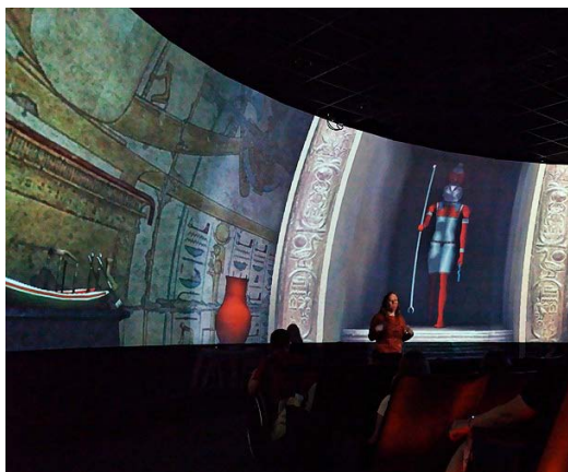
Figure 2: Guided tour of the Virtual Egyptian Temple in the Earth Theater. Compare to Figure 2

The most straightforward example is OvirapTour, a thematic extension of Carnegie MNH's Dinosuars in Their Time exhibition. Even at more than 18,500 square feet, the hall cannot hold all the stories the museum wanted to tell. One evolving topic is that of the connection between dinosaurs and birds. The new unnamed oviraptorosaur looks like an ostrich at first glance, and careful comparison shows it to be very similar. A thematic cornerstone of the exhibition is displaying animals and plants together only if they lived together in time and space; there was no place for a modern ostrich skeleton near the oviraptorosaur.