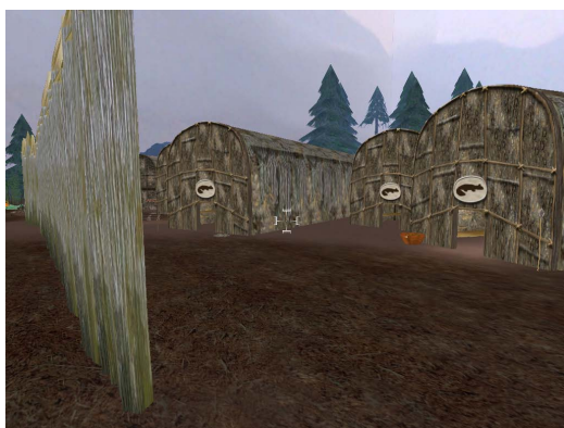
Figure 4: The Virtual Seneca Village.

they learned in school to topics such as ecology and the environment, geology, cultural ritual, agriculture, demographics, and astronomy. Younger audiences consider life as a child, and the experience of visiting the temple. The visual immersion provided by the Earth Theater, in a life-size virtual temple, makes this technique especially effective. Shows for general audiences draw from all the productions and include a mini-play to emphasize the importance of the relationship between the people and the gods. Volunteers from the audience role-play the people, priest, pharaoh, Horus, and other gods using replicas of objects in the collections, surrounded by the virtual space in which the offerings occur. The audience members can make connections between their own personal daily life and that of counterparts of the same age in ancient Egypt. Other versions of the show serve specific audiences such as art or architecture classes or groups studying comparative religion.