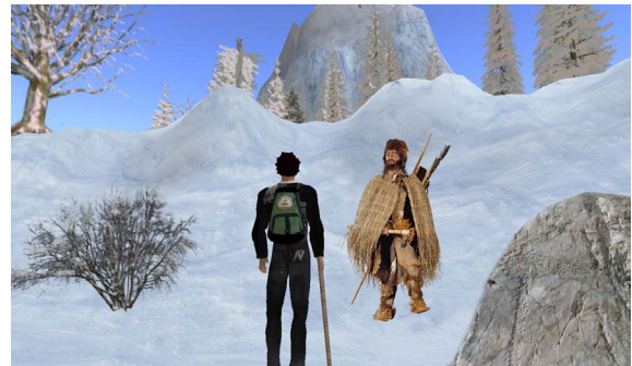
Figure 2: Visitor interacting with an agent in Second Life.

tional formalization, visitors can interact with agents via text messages and the agent will reply using our knowledge base to present the visitor with correct facts. They can also interact in an indirect manner, e.g. through performing actions in the environment and changing its state.