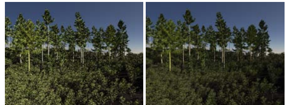
Figure 7: Interleaved sampling. a) A single primary sample per pixel and only a single virtual light source is used. b) Four primary samples per pixel are taken. For each of the four hit points four shadow rays are fired, while a different set of light sources is applied for each hit point.

However, in contrast to CAD models used in previous work on massive model visualization, the size and dense