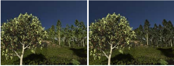
Figure 8: Adaptive transparency. a) Computing all ray segments until a non-transparent part is hit. b) Transparency replaced by the weighted average leaf color for distant leaf geometry.

structure of natural scenes required significant improvements to the rendering engine to achieve acceptable frame rates. Dense packaging, especially of small plant species, causes strong overlap between the bounding boxes of these plants. This significantly reduces the efficiency of the top-level spatial index and consequently reduces ray tracing performance. Even worse, countless small leaves textured with alpha-maps result in extremely high ray recursion levels of more than 30 segments per primary or secondary ray.