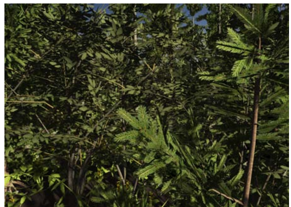
Figure 4: Close-up view of some plants revealing their highly complex structure. Every leaf texture contains an alpha-channel that controls the leaf's geometric shape. Due to the high plant density this can lead to over 30 levels of recursion until a ray hits a non-transparent surface.

Because this high amount of transparency already occurs for close-by objects, it does not help to limit the maximum recursion depth, as this would drastically change a plant's appearance. We therefore use an adaptive scheme where the maximum recursion depth of secondary rays is continually decreased with the hit point's distance to the viewer. That way traversal can be aborted, i.e. the shader can decide not to fire a transparency ray, even if the alpha-channel signals transparency at the respective hit point. The diffuse color is then replaced by the averaged color of all non-transparent texels of the surface texture.