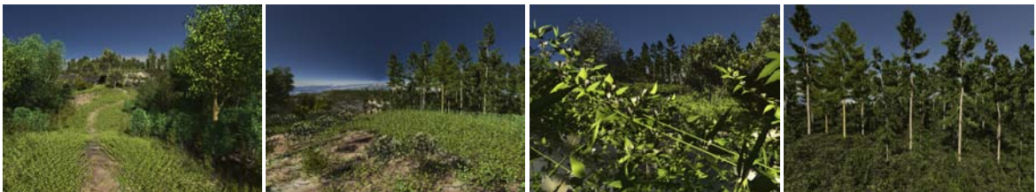
Figure 1: Example screenshots taken with our framework during a walkthrough of a complex plant ecosystem model containing more than 365,000 individual plants. Note the extremely high geometric detail, resulting in a total of over 1.5 billion polygons.

‡ Computer Graphics & Media Design, University of Konstanz {colditz, deussen}@inf.uni-konstanz.de