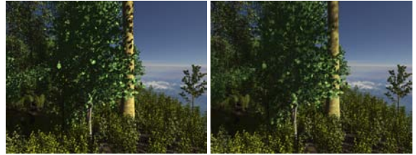
Figure 5: Visual impact of environmental high dynamic range lighting. a) Approximate sun light using a single directional light source. b) Illumination based on an HDR environment map. Note particularly the soft shadows on the tree trunk and the tree foliage.

It has already mentioned that aliasing poses a difficult problem in scenes with the geometric complexity of our test scene. This does not only account for primary rays but for shadow rays, i.e. rays that sample the environment. To make best use of a given ray budget, it is advantageous to combine anti-aliasing due to geometry and illumination [KH01, BWS03]. Rather than using the same set of virtual directional lights for every primary ray, we can break up each set into subsets, each of which applies to a different