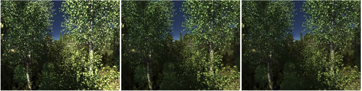
Figure 6: Progressive refinement: An image with an increasing accumulation of intermediate results. a) No accumulation. b) After 4 accumulation steps. c) After 10 accumulation steps.

that are incrementally computed when no user interaction occurs. Instead of computing a high-quality image in a single long computation, we iteratively accumulate samples computed over several frames. This is easily achieved through suitable initialization of random number generators across frames and gives frequent feedback to the user during convergence.