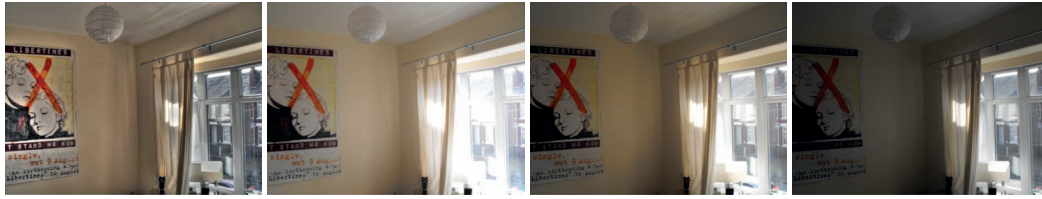
Figure 1: The top left image is a tone map of a HDR image created from the three other, LDR, images. Note that in the tone mapped image details from the scene are clearly visible both inside and outside the window.