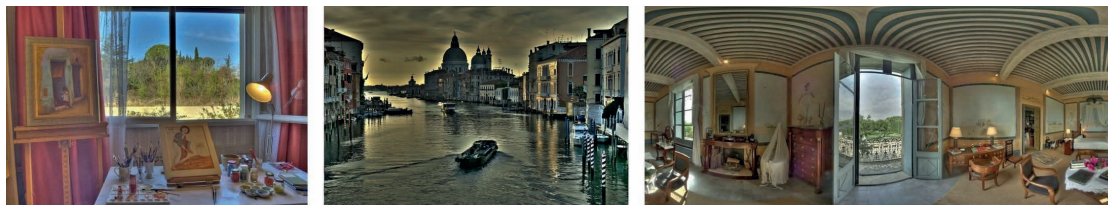
Figure 3: The three scenes used in testing (tone mapped) [hdr09].

stage of the SIFT algorithm, indicates the rate of change in the area around the SIFT keypoint. We expect that the keypoint with the highest rate of change is in the image which is best exposed due to the higher level of detail and clearer edges. Under and over exposed areas of images should have lower gradient magnitudes as the data from the edge of the LDR images have less detail, as explained in section 2.2. This will generate a series of keypoints which we expect will be similar to those generated directly from a HDR image.