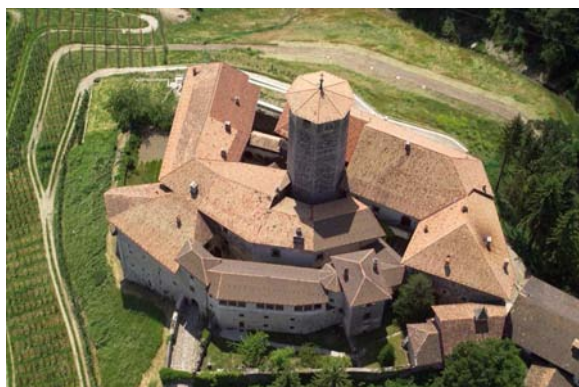
Figure 1: An aerial view of Valer Castle, located in Tassullo, Trento (Italy).

ital Surface Model (DSM) of the surroundings was also created in order to visualize the castle within its environment. In the choice of the modeling techniques many factors have to be considered, as for example the required level of detail, occlusions and the place for data acquisitions. At the end of the 3D reconstruction, the models obtained from different sources were unified in the same reference system by means of surveying Total Station and GPS. A walkthrough movie outside and inside the heritage was created as final result.