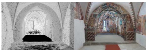
Figure 6: Different visualizations of the 3D model of the internal chapel.