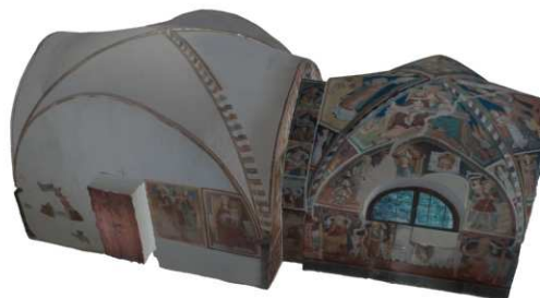
Figure 5: 3D model of the internal chapel.

shows the results of the modeling and Figure 6 shows an internal view of the 3d model of the chapel.