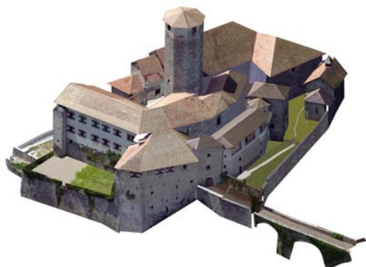
Figure 2: Overall 3D model of the castle.

In this section an example of 3d modeling of a medieval castle is reported. The medieval castle considered is a complex architecture with internal complex courtyards and narrow alleys. Both laser scanner and image-based modeling have been used to create the 3D model of the complex architecture which is approximately 35 m high (the tower) and has a base of ca 40 x 70 m. As the castle is located on a small hill, it was hard to find an adequate number of places where to capture images. Therefore 16 aerial photographs acquired from a helicopter were used to model external walls and roofs. The used camera is a Kodak DCS SLR/n pre-calibrated in our laboratories at a focal length setting of 66 mm. The camera positions were recovered with a bundle-adjustment. In Figure 2 the overall 3D model of the castle is shown.