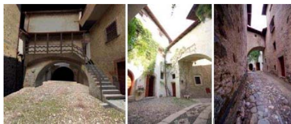
Figure 3: 3D models of some internal courtyards.

For other areas of the castle, a time-of-flight laser scanner was used to recover the required 3D model. In particular, the internal chapel of the castle was scanned with a Leica HDS3000 and a resolution of 1 cm. Furthermore, for the texturing of the model, images acquired with a Kodak DCS Pro SLR/n and a focal length of 18 mm, were used. Figure 5