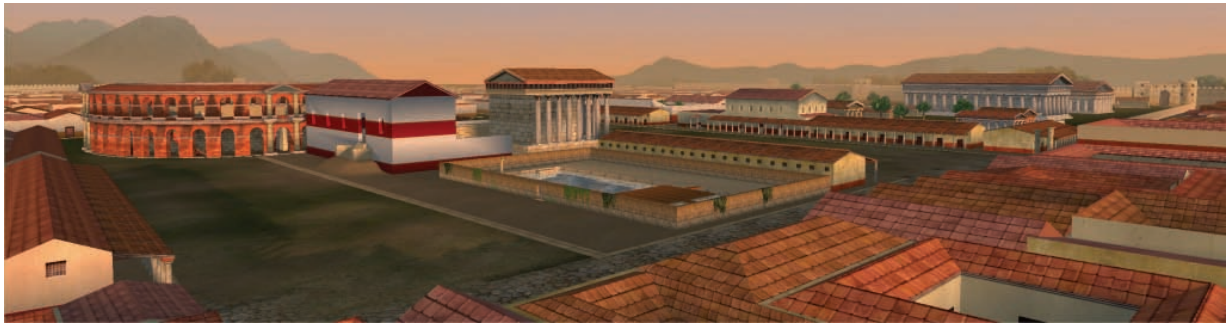
Figure 2: A landscape view of the reconstructed Poseidonia-Paestum. The reconstruction of (left-to-right) Amphitheatrum, Forum, Comitium and some Tempia are visible.