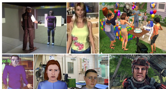
Figure 1: A mind experiment: Imagine a virtual agent in a virtual world. A user is coupled to this virtual world through different input and output channels. Agent and user can perceive and act and freely interact with each other and the environment. The challenge is the following: to transfer the agent to an alternative virtual environment while maintaining all his properties.

The application of such metrics during RIS development is inherently difficult. Strong data and process dependencies do exist, from 6DOF (degree of freedom) data or object shape approximations in different modules, to complex interdependent execution schemes and process flows in order to simulate consistent worlds. Ideally, simulators would be build around simulation properties which in turn would be implemented by dedicated exchangeable and extensible software components. Just how distant RIS technology is from this goal is made clear by the mind experiment illustrated in Figure 1.