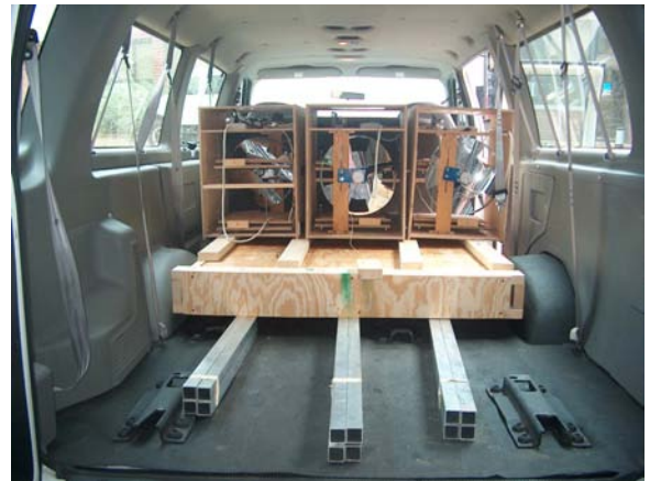
Figure 4: Mirrors (boxed), frame members, and alignment boxes in van.

The combination of this approach to stereoscopic projection, use of commodity personal computers for rendering, and ancillary optimizations, enabled us to construct a portable version of the CAVE for under $30,000. The system weighs less than 500 lbs and fits into the back of a fifteen-passenger van (Figure 4) with one remaining row of seats. See Table 1 for weights and costs of each major system component.