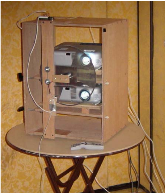
Figure 1: Early alignment box with aluminum chopper wheel.

We aligned the projector's images using a locally-developed wood alignment box with numerous adjustments; the chopper wheel was an aluminum disc twelve inches in diameter and 1/8" thick with two ninety-degree openings. A small DC motor attached to the face of the alignment box drove that optical chopper. We selected inexpensive liquid-crystal display projectors with XGA resolution; SXGA-resolution projectors would improve our overall visual quality but raise our projector costs roughly threefold.