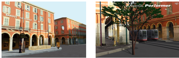
Figure 4: Left, the VE with the textured version of the above model. Right, the final VE after the addition of virtual elements, realistic shadows and lighting.

The second approach uses projective textures using layered images [RD03]. As described above, the capture process provides images layered by visibility, thus avoiding the need to subdivide the geometry according to each viewpoint. Each layer of the image is the projective texture corresponding to the appropriate part of the model. A similar blending approach is used for multiple viewpoints. Details of this approach are described in the paper [RD03].