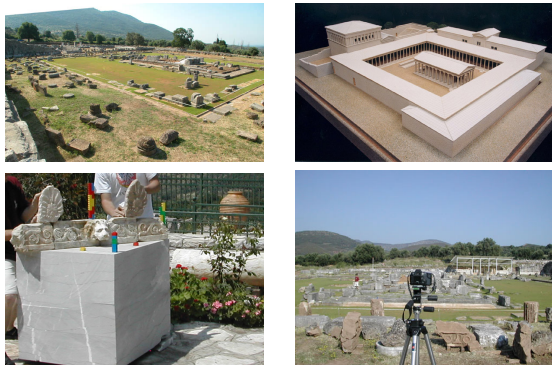
Figure 2: Upper row: The ancient site of Messene, and the plaster model built by archaeologists. Lower row: photographs taken during the capture process.

Nevertheless, problems that arise from the use of view dependent texturing exist and are handled on a case by case basis. We have discovered that a large number of view dependent textures have to be used when the user travels long distances in the VE because in this case the parallax of the images is too large and image coherence is a problem. Depending on the importance of the object being textured a detailed modelling effort can alleviate the problem.