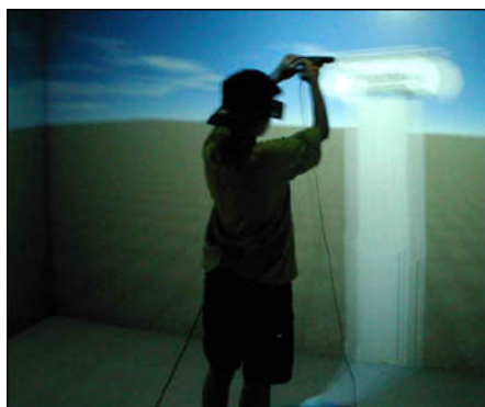
Figure 7: A young student interacting with an early version of one of the CREATE environments during the exploratory user studies in a cubic immersive display.

the user interacted with the system, both on a technical and a conceptual level. The analysis of these incidents was guided by the framework of Activity Theory [Nar96] [BHB99].