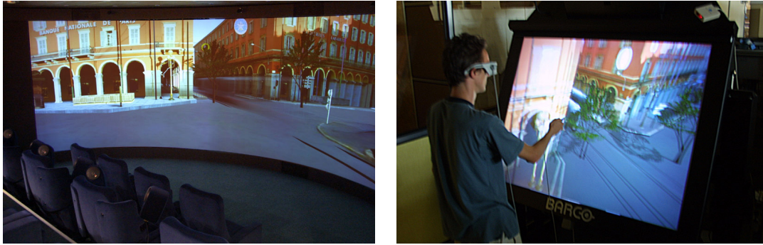
Figure 5: The VE of the urban planning/architecture application as displayed on an immersive curved-screen display and on a workbench.

modification of the basic rendering channels, and restricts the efficiency of multiprocessing. Nevertheless, in our experience, the benefit of having working software components for all the VR device issues largely outweighs the difficulties encountered.