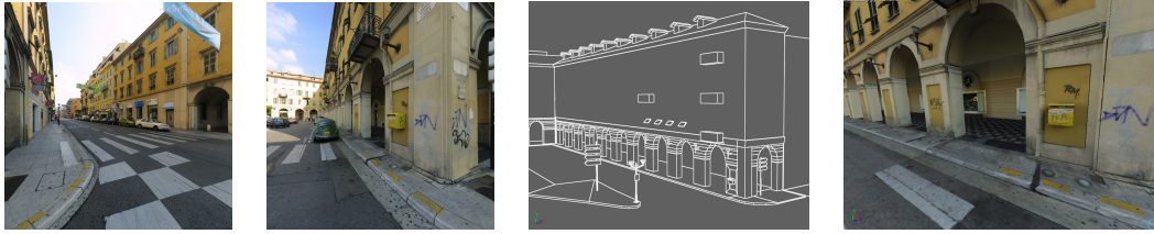
Figure 1: Two faces of a panorama cubemap used for image modeling. Wireframe of the resulting model and a view with extracted textures.

and ImmersaDesk TM VR displays to educate children and entertain families, plans to add the final VE in its repertoire of educational and recreational exhibits for visitors.