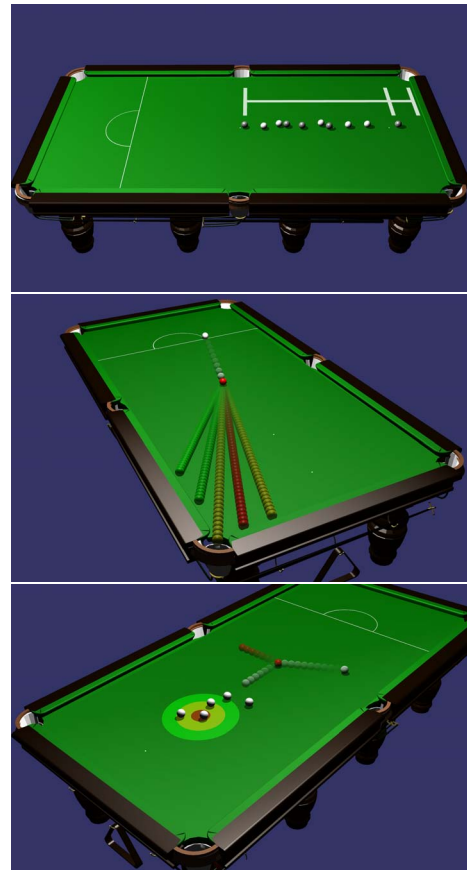
Figure 3: Training tool using illustrative annotations.

From the 3D time-varying model, we can produce illustrative graphics with various annotations. For example, a player often repeats a particular shot a number of times in order to perfect one's control of cueball power, potting and cueball positioning. The resulting videos are processed by our system to generate graphical feedback for the player. Figure 3 shows three such examples. The illustrative graphics annotates (a) the spread of the cueball finish spot, (b) the motion of the target ball, or (c) the finish spot of the cueball with regard to a particular target area.