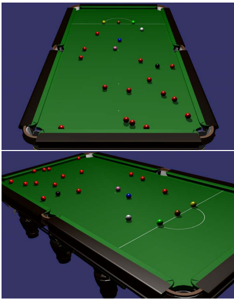
Figure 2: 3D reconstruction of captured scene.

top-down view introduces undesirable distortion, the reconstructed balls would be neither of a correct shape nor at a correct position without a correction process. To correct such reconstruction errors, we used the specular highlight on each ball to determine the normal vector at the surface point. Based on this normal, we can determine the central of the ball, since the size of each ball is known. We then assign colour to each ball by comparing the HSL values of the ball imagery against a pre-defined classification scheme. Once the first 3D model is obtained, each ball is tracked for subsequent frames. Our model repair capability also includes automated methods for removing unexpected objects in the scene (e.g., the player and cue).