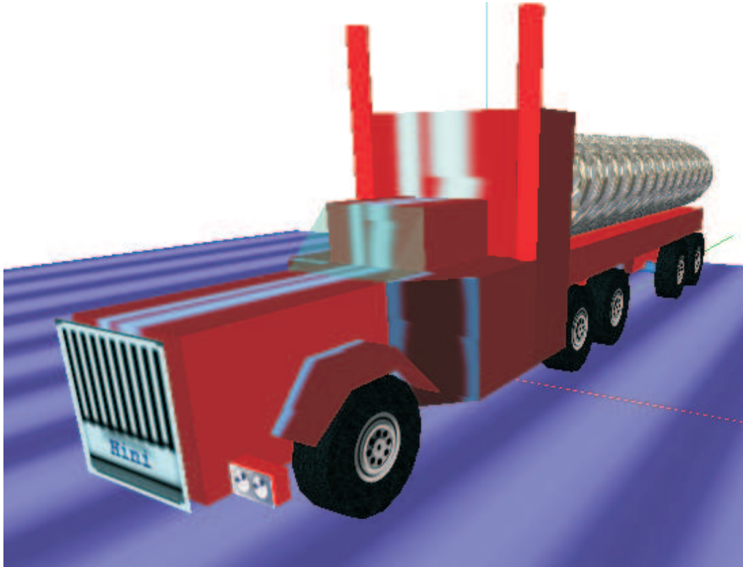
Figure 1: Example of textured object truck built with GLU and GLUT graphic primitives.