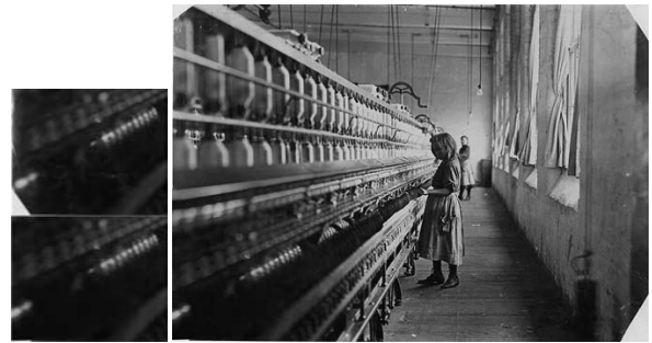
Figure 7: The scan from the Library of Congress has water damage in the bottom left corner (see Figure 5). Fortunately it is an area of low detail. A region from the scan from [Kot05] (depicted also in Figure 5) is used to restore it.

Figure 6: Algorithm to restore an image base using image i . selectRegionToRestore could be implemented automatically by first matching both prints (using matchPrint ) and then computing areas in which they differ significantly; or manually, with the assistance of an operator. blend takes both the matched region to restore, and the base print, and combines them without a visible seam (it can be implemented using an algorithm such as [Aga07]).