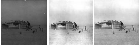
Figure 8: Dust Storm, Cimarron Country, 1937, by Arthur Rothstein; in the public domain. Left, high resolution scan from dirty gelatin print, Library of Congress, USA (ppmsc.00241); center scan from book [Ros84] crediting a gelatin print also from the Library of Congress, USA; right, restored image. For this photo the sky of the match print has been replaced with the sky from the base print and has been slightly cropped to remove the edge imperfections.