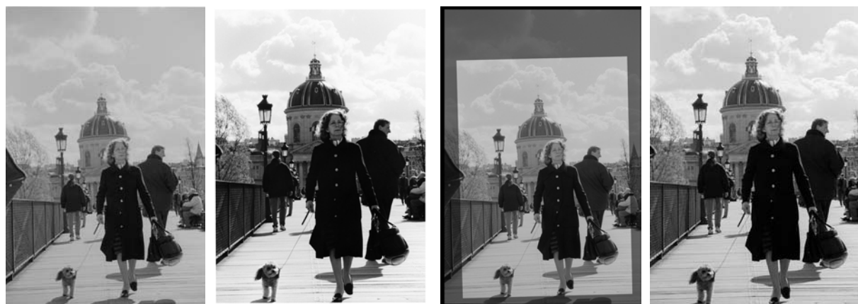
Figure 3: Crossing Pont Neuf by D.M.German, used with permission. The first image is the negative and looks flat. The second is the base print and shows lack of detail in the shadows (i.e. dress under her coat) and highlights (areas of the sky). The third shows the computed cropping, when applied to the negative. The last image is the matched print. Notice how the shadows and highlights have been recovered, while maintaining the overall contrast of the base print.