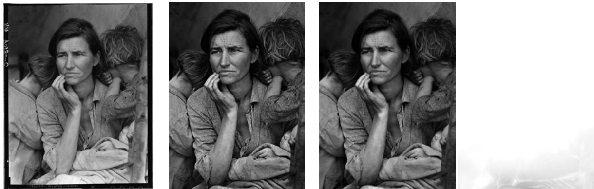
Figure 12: Migrant Mother, 1936, by Dorothea Lange; in the public domain. The image corresponds to the scan of the 4x5 negative done by the Library of Congress of the United States (LC-DIG-fsa-8b29516). The base print is significantly lower resolution and was created by Mike Johnston [Joh06]. The third is the dodged-and-burned matched print (using the scaling method). The final image is the unblurred burned mask. Notice how the bottom of the image has been darkened. The image required no significant dodging.