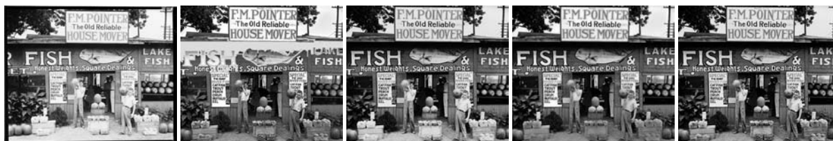
Figure 10: Roadside Stand Near Birmingham by Walker Evans (1936). Negative from the Library of Congress; in the public domain. Its printed area is approx 4800x3780 pixels. The second image is the base print: a low resolution version by John Hill as it appeared in [Kim06]. It measures 531x450 pixels and was created digitally from the same scan of the negative. The cropping properly centers and balances the print. Notice how the matched print is still very light in the foreground. The fourth one is the burned-and-dodged matched print; it measures 4303x3679 pixels. The burned areas in the foreground have lost contrast. The last one uses burn-and-dodging with scaling. It produces a better image and it is very close to the base print.

other methods to dodge and burn and obtained better results when the same level of burning applies more to darker areas than lighter ones (and vice-versa for dodging). We call this method dodging-and-burning with scaling. An example of such method is Photoshop’s “color dodging” and “color burning”. Because this dodging and burning tends to have a lesser effect compared to the additive method, it is necessary to compensate by darkening the masks before they are applied.