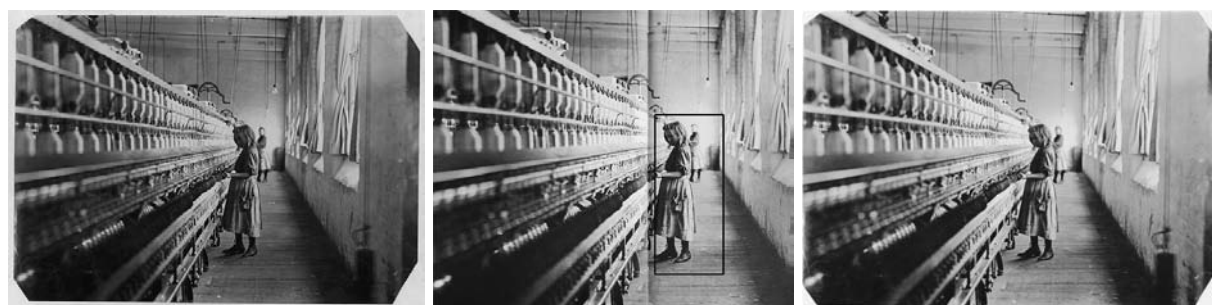
Figure 5: Sadie Pfeifer, 48 inches high has worked half a year. (1908) by Lewis Hine; in the public domain. An example of a matched print created using only a section of the original image as the base print. The image on the left corresponds to a scan of a print by the Library of Congress (nclc 01455). The one in the middle is a scan from a book [Kot05] (a double page spread, hence the darker area in the middle; it has been slightly blurred to reduced the effect of halftoning printing). Only the boxed area is used as the base print. The one on the right is the matched print.