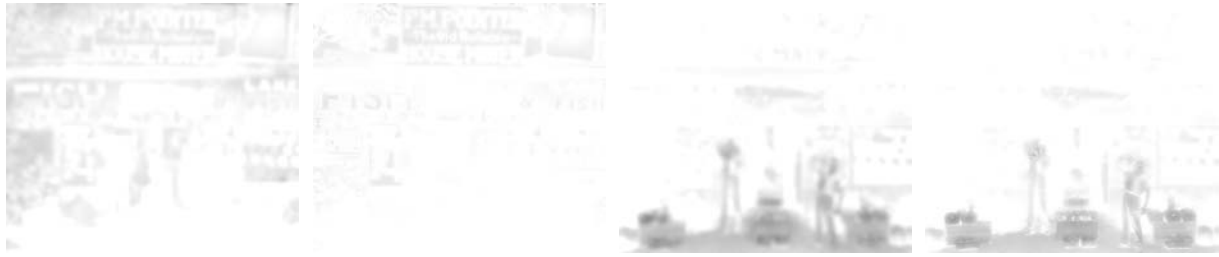
Figure 11: Dodging (left) and burning (right) applied to the matched print (blurred and unblurred). The dodged version is presented as the absolute value of pixels below zero, and the burned as the positive values only. Notice in particular how the burning applies mainly to the foreground and the two kids, while the dodging tries to brighten the rest of the print. For presentation purposes the pixels in these masks have been inverted: white means no contribution, and black full contribution