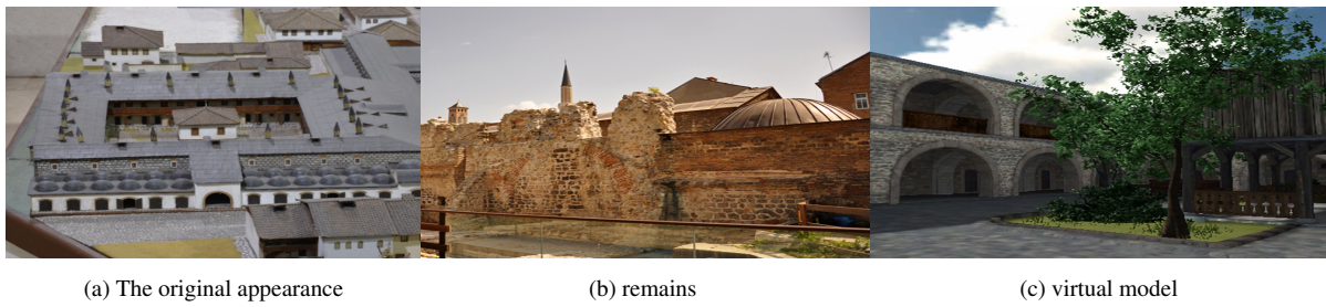
Figure 1: Tašlihan, Sarajevo, Bosnia and Herzegovina